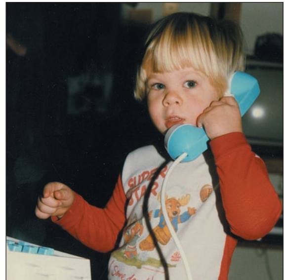
Bean practices on the telephone like this child.

There are several instances in the book where the question of honesty comes into the story. Marlene takes Julie's marbles in one case. In another instance, Julie plans to forge her mother's signature on her poor work papers. Why do you think people behave dishonestly sometimes? Is it ever OK to be dishonest? Have you ever been dishonest? How did you feel?