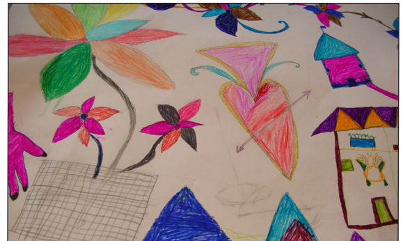
Drawings by refugee children.