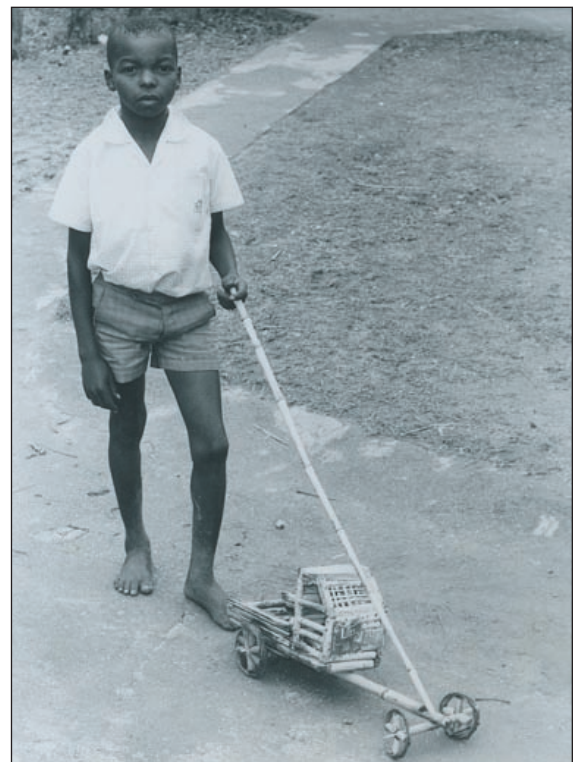
A young Malawian shows off his bamboo galimoto.